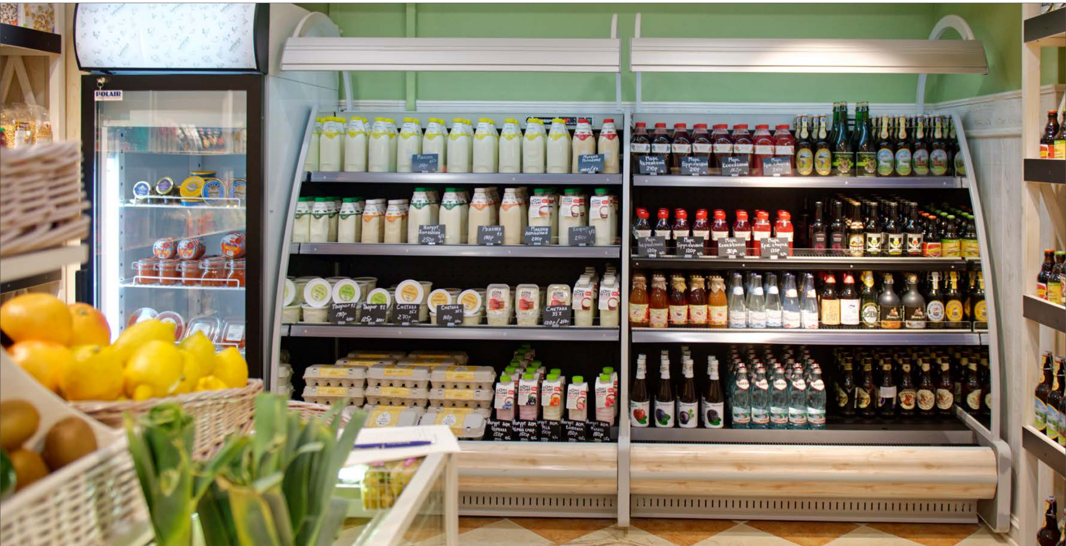
Multi-deck version of semi-vertical refrigerated cabinet Butterfly with upper lighting canopy